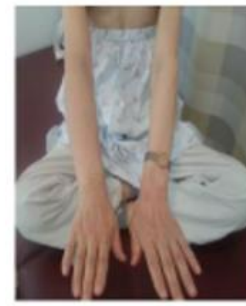
Fig. 2. Status of a lymphedema on dorsum after treatment